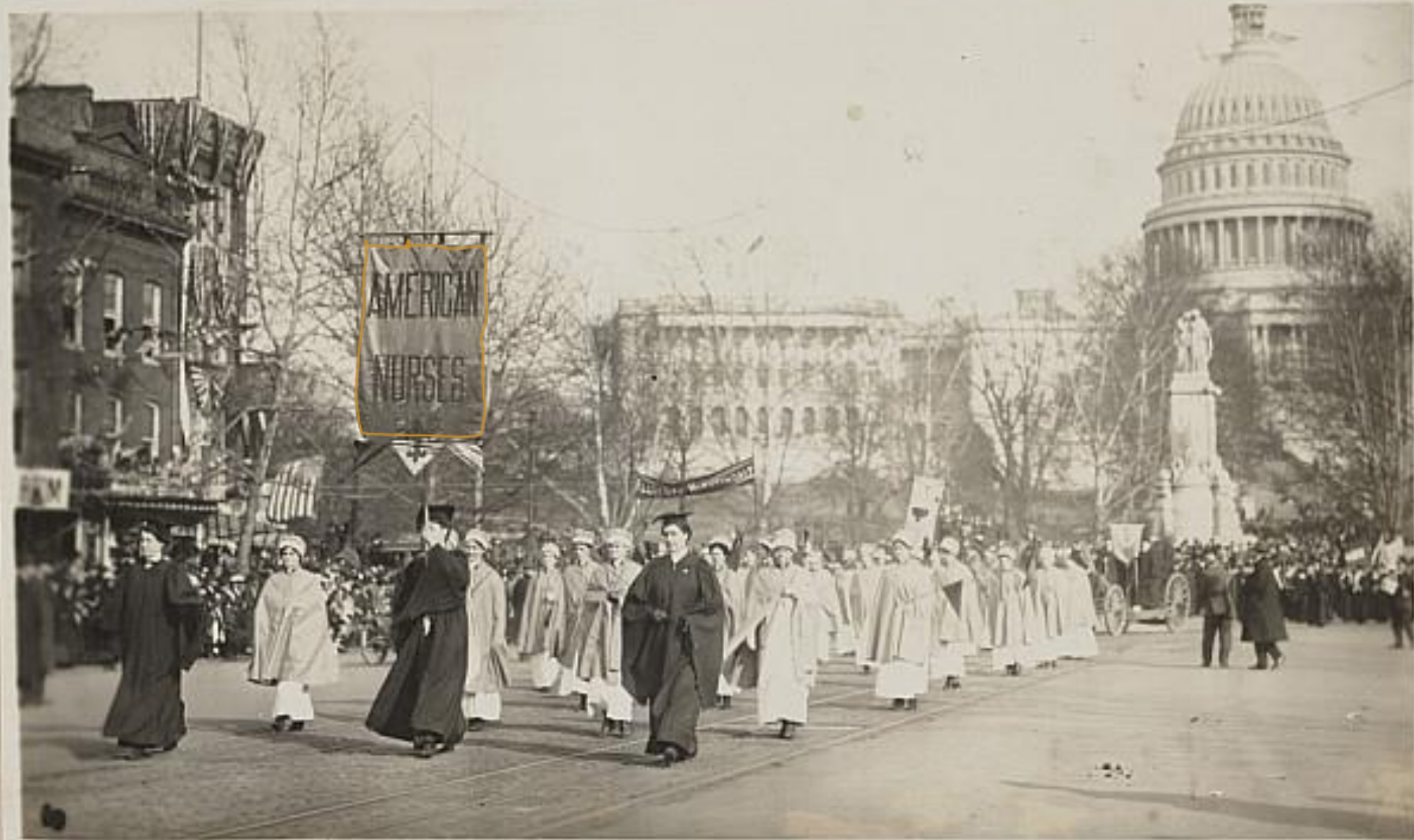
SUFFRAGETTE PARADE, MARCH 3 RD 1913